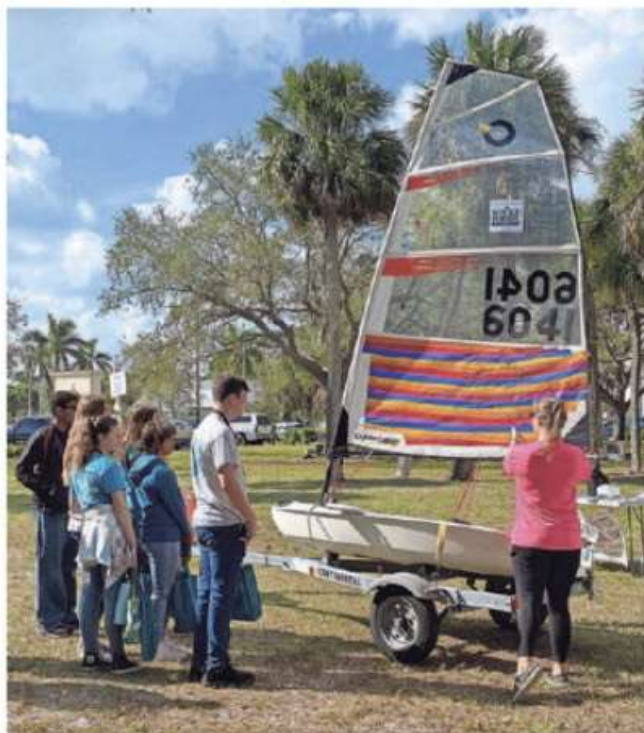
St. Lucie public school students with a representative from the Treasure Coast Youth Sailing Foundation, Inc. were hands-on with rigging the sailboat.