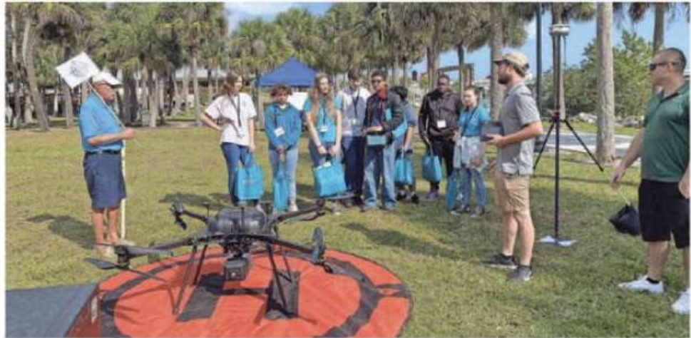
St. Lucie public school students learn about careers in the surveying industry with industry representatives from SurvTech Solutions.